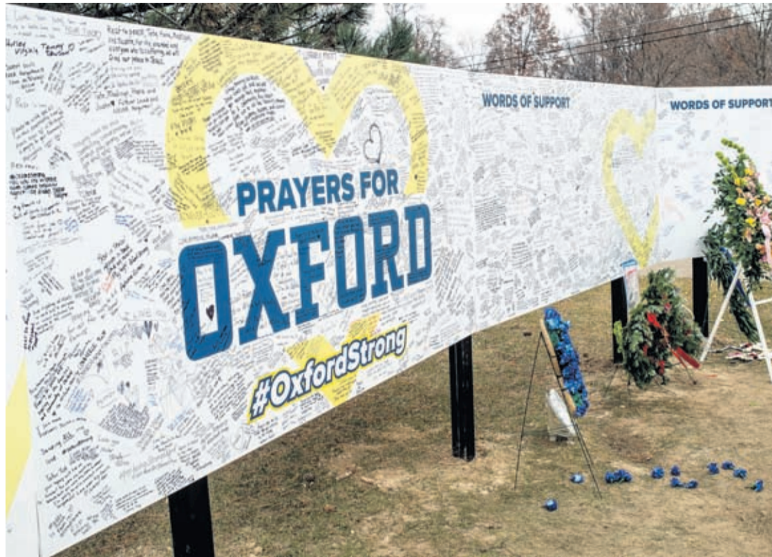
Handwritten messages are left at the memorial site at the memorial site on Tuesday, Dec. 7, 2021, outside Oxford High School in Oxford, Mich., after a 15-year-old allegedly killed these four classmates, and injured seven others in a shooting inside the northern Oakland County school one week earlier.

With stress levels already soaring from the effects of the pandemic and a rash of hoax threats following a deadly school shooting in Michigan on Nov. 30, districts said they were taking precautions out of an abundance of caution.